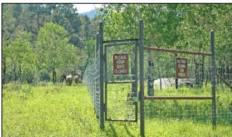
Elk enclosure fence

These temporarily fenced areas were established to allow the recovery of riparian (streamside) vegetation such as willows, and to restore the habitat value for riparian-dependant wildlife species. Areas inside the woven-wire “sieves” have been altered to unnatural conditions through years and years of over-browsing and trampling by our unnaturally dense elk population, making them unsuitable for riparian-dependent species such as beaver, Wilson’s warbler, Lincoln’s sparrow, and altering the streams to be less than ideal habitat for trout. As the habitat values inside the fences are restored, the design allows their easy removal, perhaps to be moved to another area needing restoration. Visitors are encouraged to look at the differences in vegetation inside and outside these areas to judge for themselves how well it’s working.